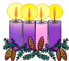
Fourth Sunday of Advent

Today, the fourth Sunday of Advent we think of Mary and Joseph. For them this was a terribly testing and disturbing time. Mary was not trusted at first by Joseph and the stress on their engagement is only eased by the visit of an angel. Both are told, 'Do not be afraid'. It's consoling to all of us to know that vital steps in faith are often very difficult. Jesus wants to be born anew in our hearts. He desires our 'Yes' to the good news that he saved His people from their sins.